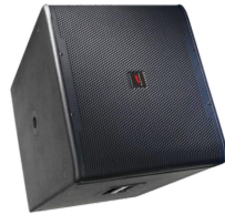
● KP-618 / KP-625