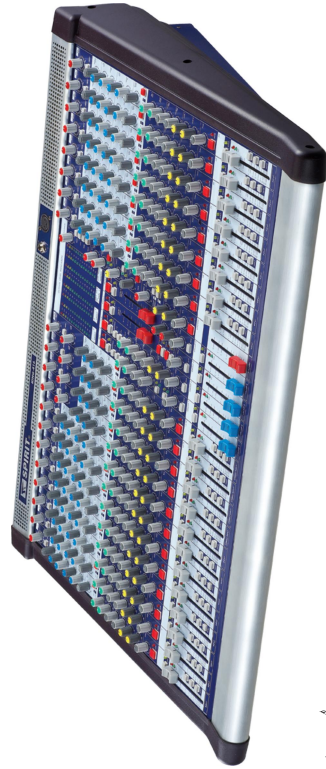
KING-416 / KING-424 / KING-432