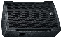
EX passive two way 10 inch speaker