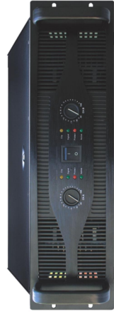
CH-1000 / CH-1200 / CH-1600