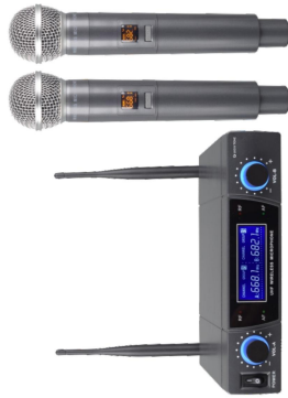
WM-58U Standard UHF with 2 wireless microphones