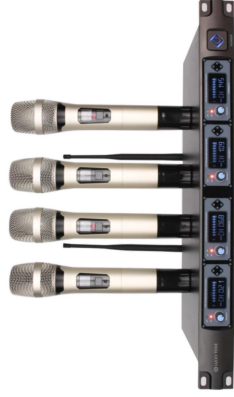
WM 4000U Standard UHF with 4 wireless microphones